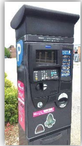
Surface parking lot kiosk

Parking Rate: $1 per half hour; max $8 per day