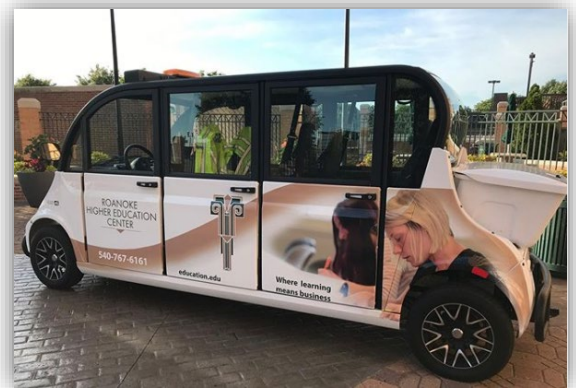
A shuttle is available to transport you to or from your vehicle. Call RHEC Security at 540-767-6001 to request a ride.

Assistance for Persons with Handicaps/Disabilities: RHEC’s primary entrance at Jordan Alley is ADA compliant. Designated accessible parking spaces are in the Higher Ed Center Lot 1 and student lot 2 . Both Valley Metro and Radar provide public transportation for those who require assistance.